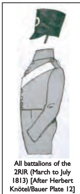
All battalions of the 2RIR (March to July 1813) [After Herbert Knötel/Bauer Plate 12]

UNIFORM: Grey regulation reservist uniform.